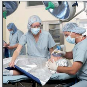
During the perioperative period